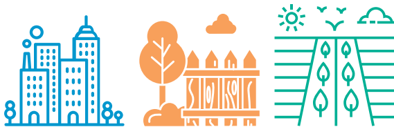
CITIES, COUNTIES, TOWNSHIPS & VILLAGES