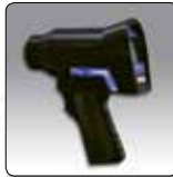
Speedgun Pro hand-held