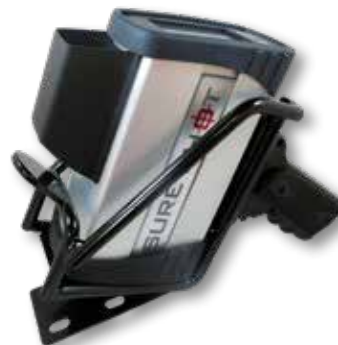
Optional SURE SHOT Moto Holster