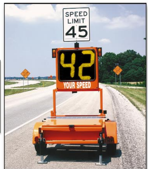
Orange version available